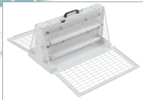
360° of light emission